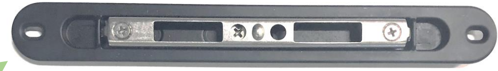
CONTEMPORARY HANDLE, LOCKS TO A JAMB